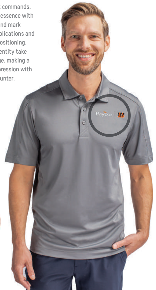
Co-Branded Chest Application

WE REDEFINE THE POWER AND POSSIBILITY OF PRINT